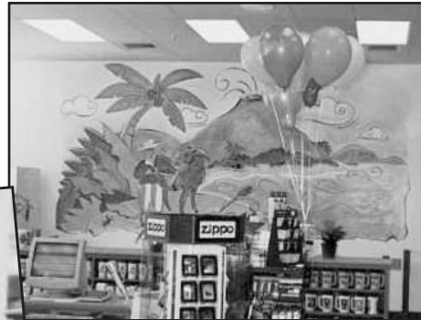
▲NEW Store graphics.

Roseann makes sure the Store is well stocked. ▶